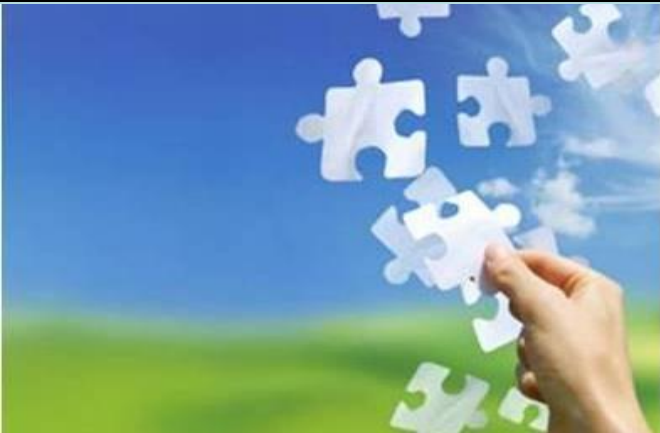
Career Planning Readiness Self Assessment

A Customized Career Tool for Excelsior Students and Alumni