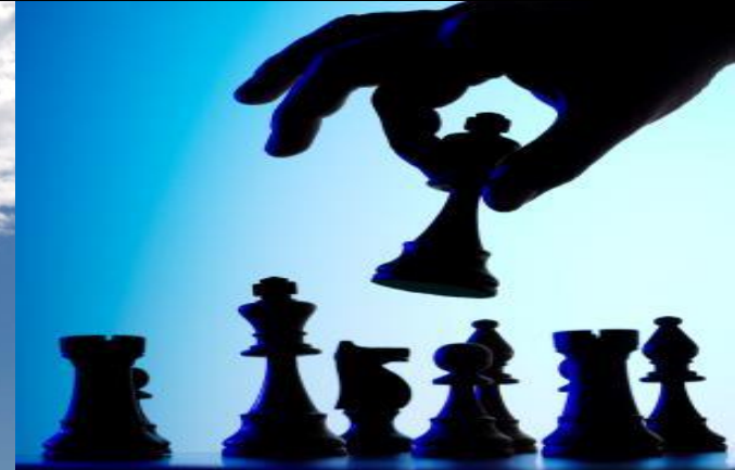
Action Planning, Decision Making