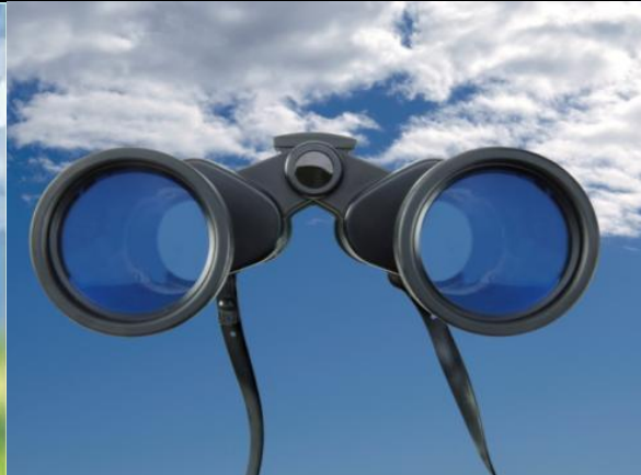
Degree and Career Exploration